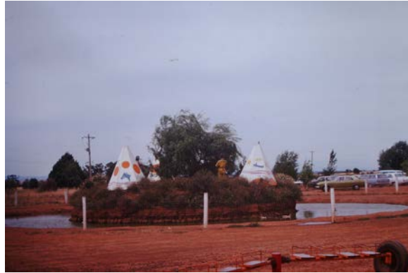
Indian Island, Bullen's Lion Safari Rockbank Victoria.