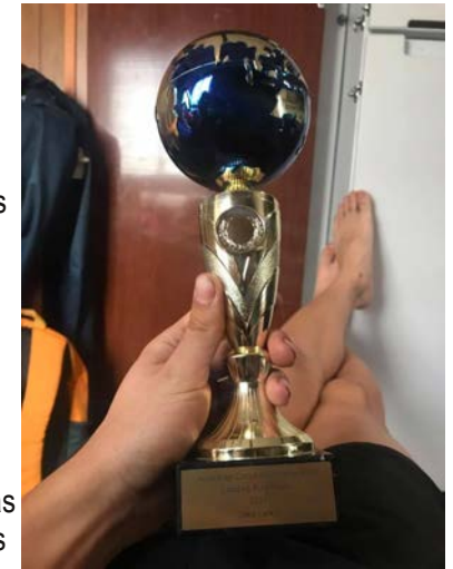
Australian Circus Festival to represent CFA.

It is my hope that my hip operation will allow me to attend the fourth annual